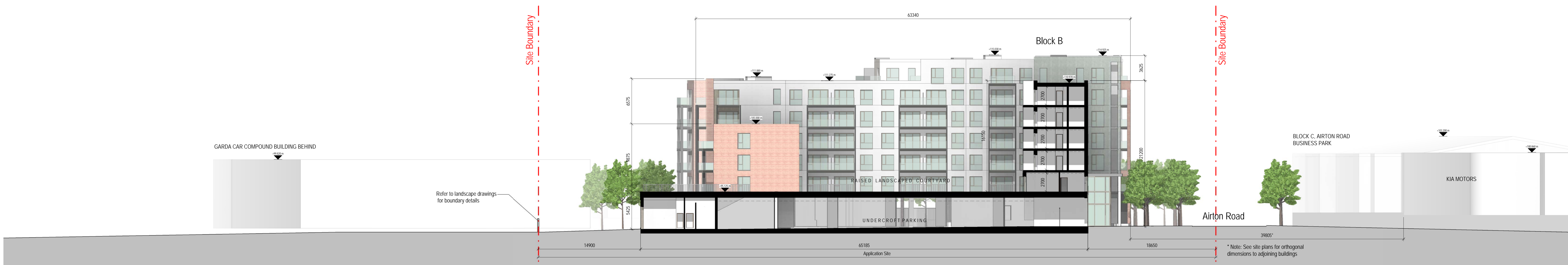
02 - Proposed Site Sectional Elevation B-B 1:200